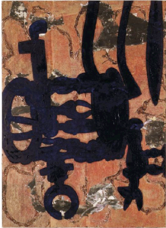
Bo Joseph, Strata: Judgement , 2006 Oil, acrylic, wax and collage on panel 55 1/4 x 40 inches

Opening Reception: Wednesday, February 13, 5 – 7 pm